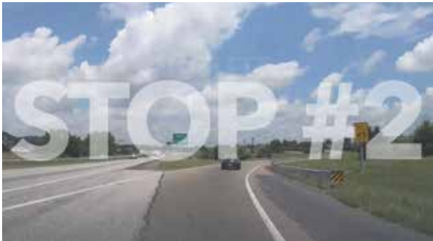
Stop #2 of 5 highlighted our food manufacturing industry with a tour of Route 11 Potato Chips.

In reaction to the COVID-19 pandemic, the SVP quickly pivoted our traditional outbound and inbound lead generation efforts to a virtual platform. We leveraged our twelve 60 second virtual site tours to provide consultants the advantage to site select from their home office. We hosted a Virtual Roundtable event to describe how the Shenandoah Valley’s interstate infrastructure, rail lines, third-party logistics providers, inland port facility and regional air service create a complete support system for industry in our region. During the Roundtable, SLCs heard from The Port of Virginia, Shenandoah Valley Regional Airport, Mercury Paper and InterChange Group, Inc. who experience daily how this network fully supports businesses in the Shenandoah Valley. Lastly, we hosted a Virtual Familiarization Tour where SLCs experienced our economic development assets through “video stops” and had the opportunity for discussion with partners along the way representing Merck, Cadence, Route 11 Potato Chips, InterChange Group, Inc., Shenandoah Valley Regional Airport, James Madison University, and Blue Ridge Community College.