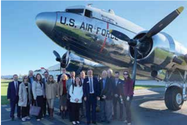
SLCs enjoyed a behind-the-scenes tour of Dynamic Aviation, an active workforce development partner and leading provider of innovative special-mission aviation solutions worldwide, before a flight on their restored DC-3 airliner, Miss Virginia.

“Impressive activity and investment from existing businesses that recognize a dedicated workforce and top-notch quality of living.”