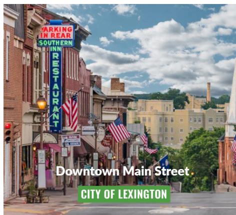
Downtown Main Street