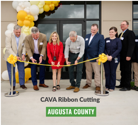
CAVA Ribbon Cutting

Learn more about the highlights shown at theshenandoahvalley.com/news