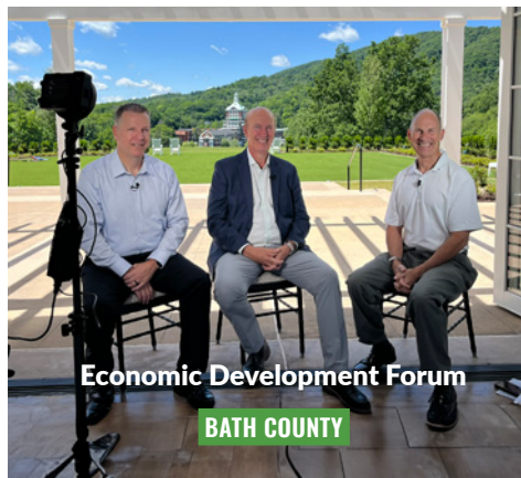
Economic Development Forum