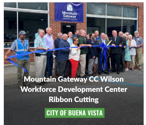
Mountain Gateway CC Wilson Workforce Development Center Ribbon Cutting