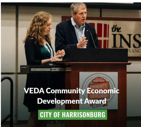
VEDA Community Economic Development Award