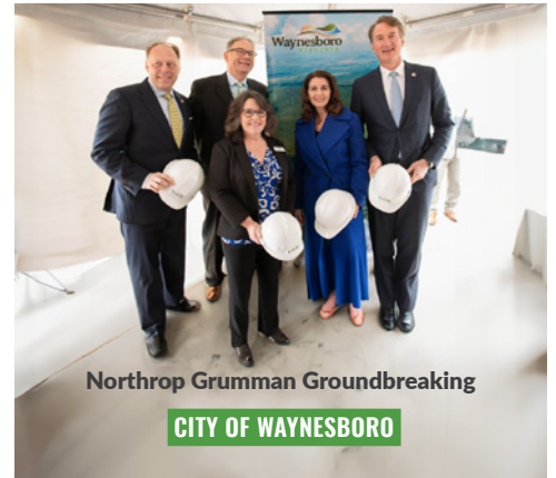
Northrop Grumman Groundbreaking